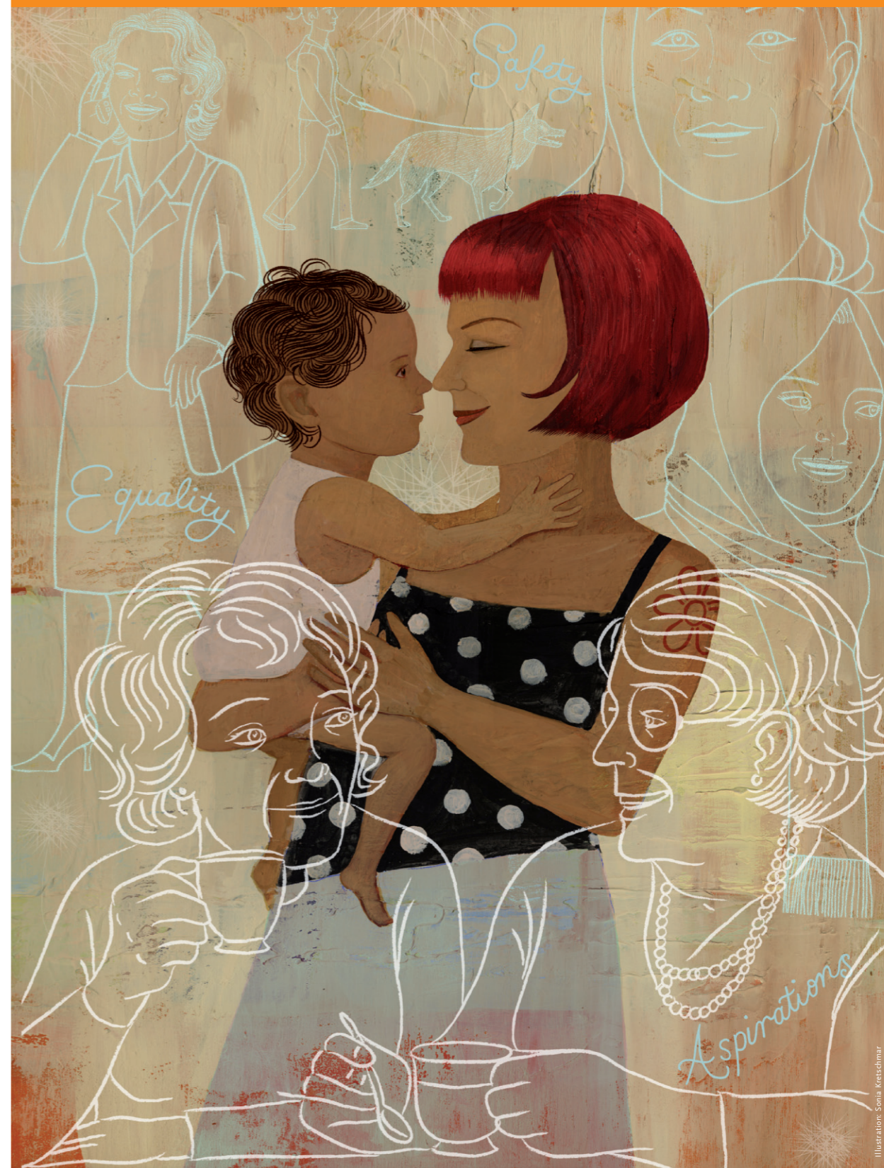
Illustration: Sonia Kretschmar