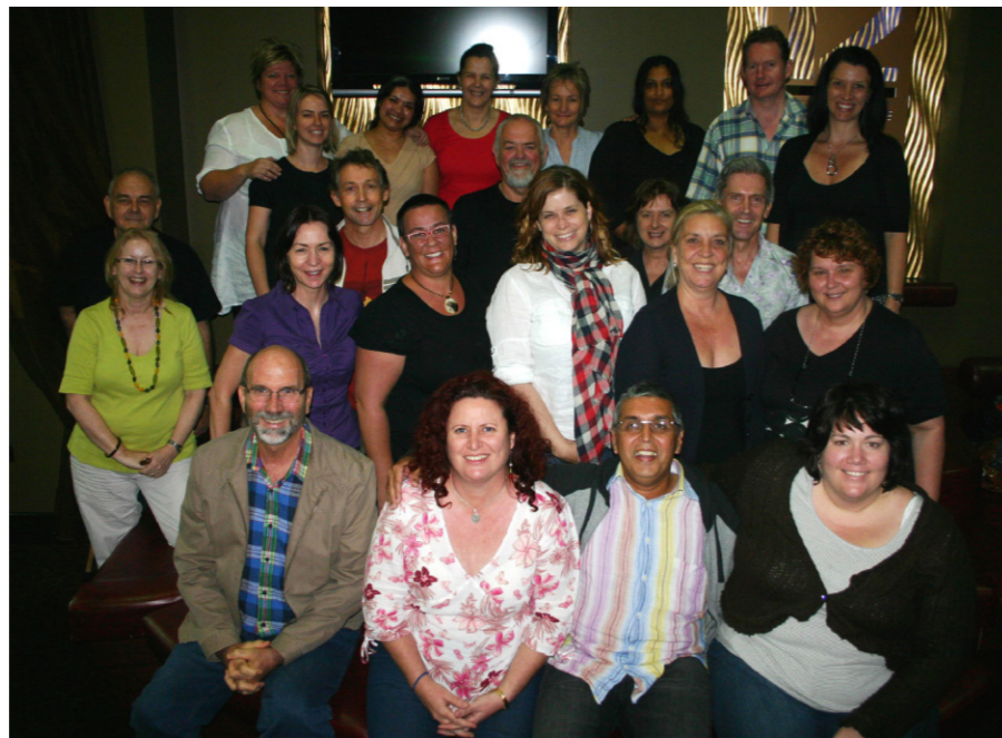
Strategic Planning Day with Micah Projects Board and Leadership Team, 12 March, 2011.