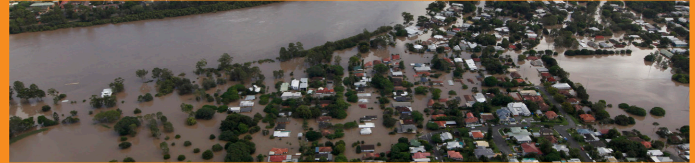
The flood peaked in Brisbane at 4.46 metres on January 13, 2011.