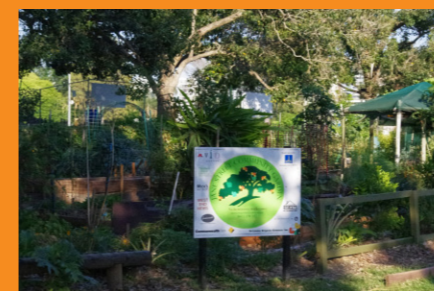
The garden flooded and growing again.