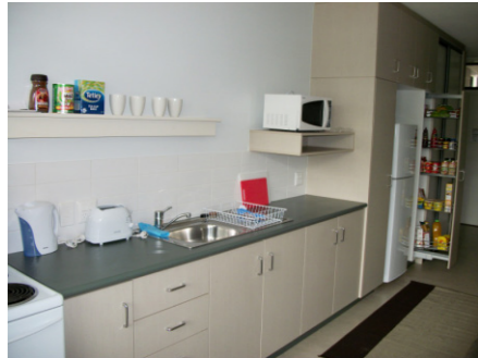
A newly established unit for a person housed through the 50 Lives 50 Homes campaign.