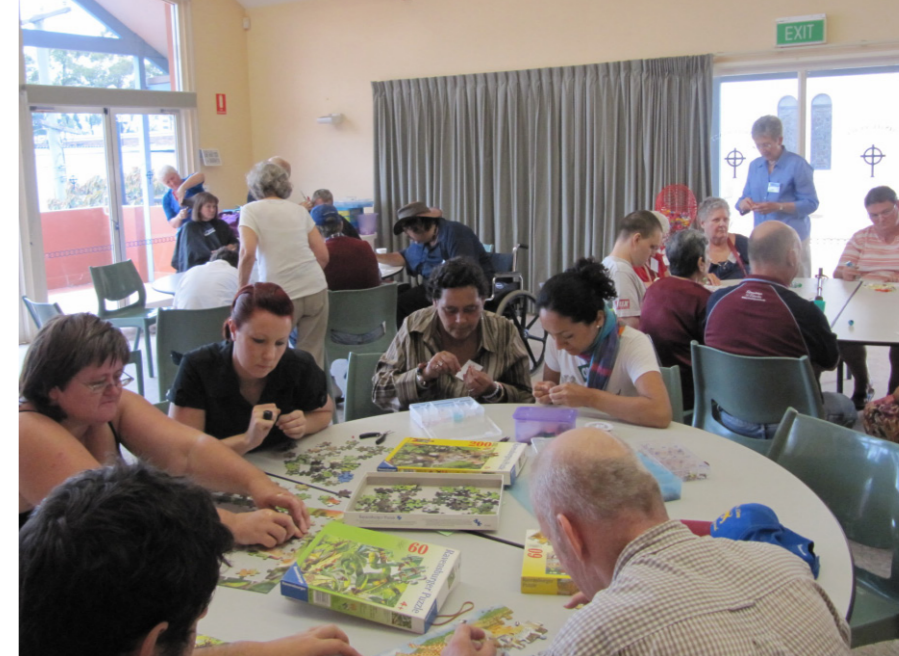
The Resident Support Program's Campbell's Club now established at Trinity Place, Woolloongabba.