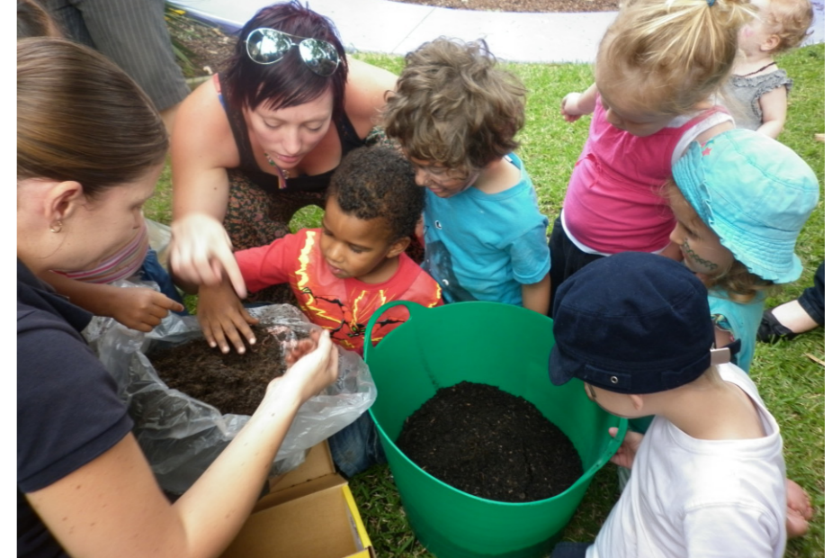
Tending the worm farm at Caterpillar House.

As an organisation we demonstrated our ability to work together doing what we do in the lives of marginalised and disadvantaged people, but this time assisting the whole community. We worked alongside other community organisations in responding to the devastation, personal trauma and displacement of so many people. Micah Projects staff focused on supporting people to exit the Evacuation Centre through finding alternative accommodation options, connecting them with family and linking them with the resources they needed. We also managed volunteers who presented to assist.